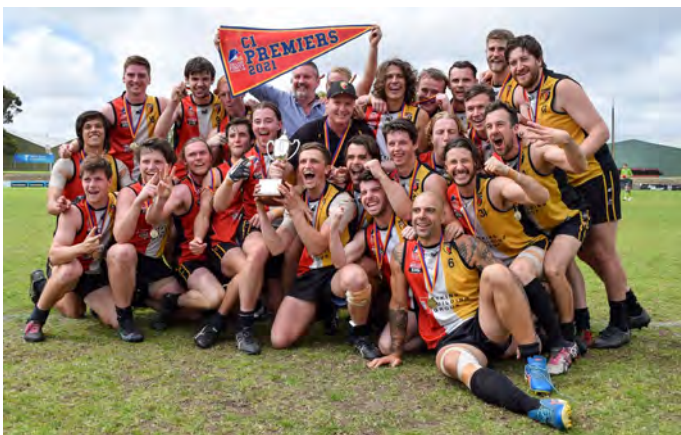
C1 Grand Final GSFC Def Port District FC, 11/9/2021 at Hisense Stadium.