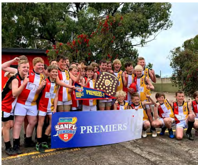
U12 Boys GSFC 3.1 def Lockleys 2.0