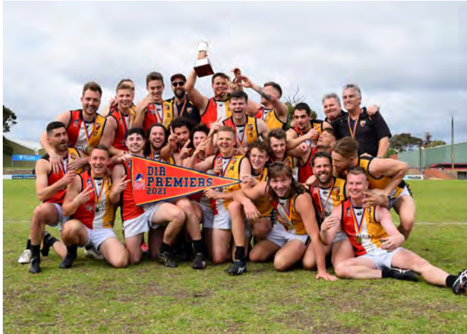
Div 1 Reserves (B grade) Grand Final, GSFC Def Payneham NU, Saturday 11/9/2021 Hisense Stadium.