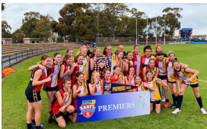
U13 girls GSFC 3.2 def SMOSH 3.1