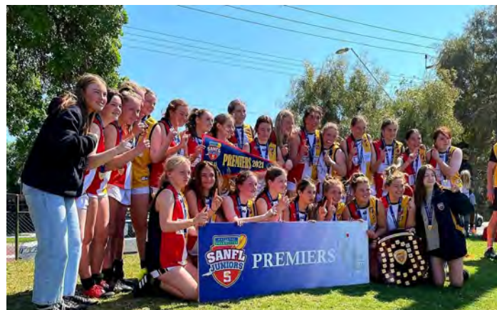
U15 girls GSFC 2.2-14 def Henley 0.7-7