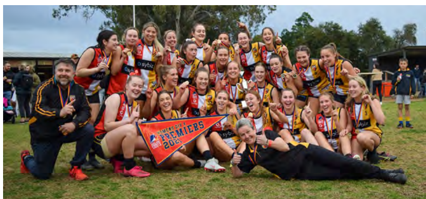
Div 4 Women GSFC Def Henley Sharks Football Club 28/8/2021