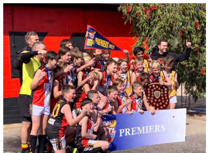
U13 boys GSFC 5.2 def Plympton 4.3